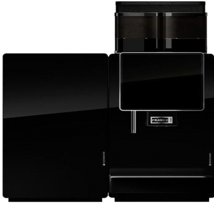
*FM CM 1G 2P optioned model pictured

Please note that the FRANKE A1000 is not a standard stocked model & is a special order ex-FRANKE Switzerland & may incur additional freight costs.