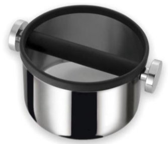
Bar Knock Box