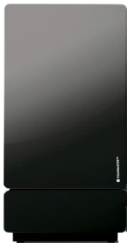
SU05 MS2 5lt Milk Fridge Option

- Connections Fittings [PLV 350KPA / ¼ - 3/8 fitting / 1M Hosing] $ 107.15