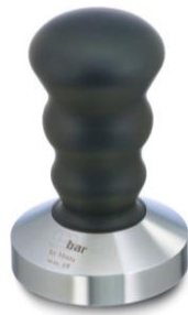
9 Bar Tamper