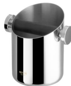
Domestic Knock Box