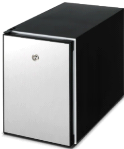
CF2 4lt Milk Fridge Option